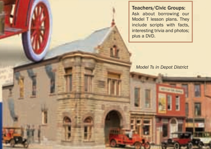
Model Ts in Depot District